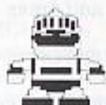
ROBIN MASK Tower Bridge